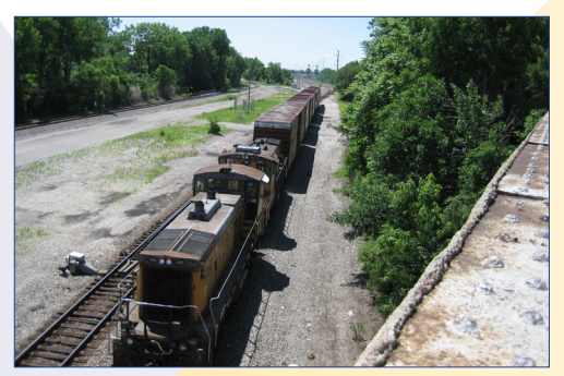
Existing conditions P2 project

with the Rock Island District (RID) line. This new structure will require right of way acquisition, and Metra issued a Letter of Interest and Qualifications (LIQ) in April 2022 for related professional services. Metra and other professional services consultants also continue to prepare final design plans for this work.