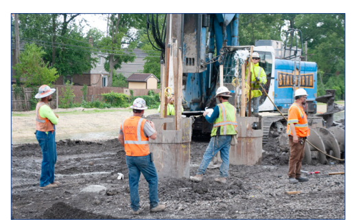
Workers drill shafts for P3 flyover project