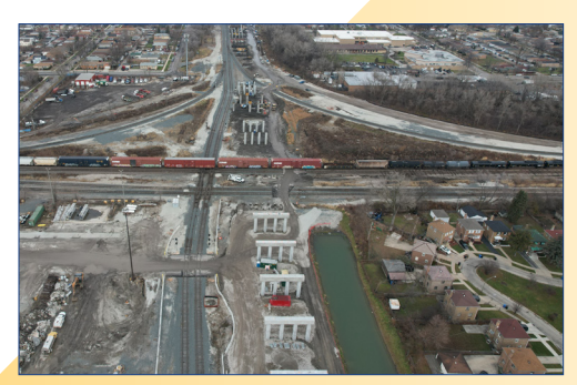
Aerial view of P3 flyover site